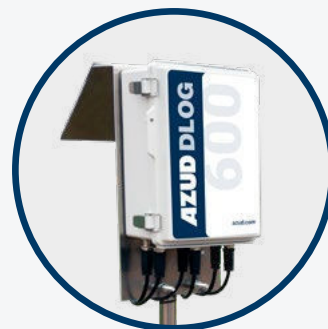
AZUD DLOG 600