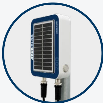
AZUD DLOG 200